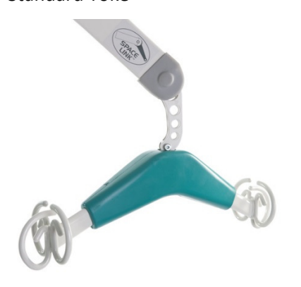
Tri Hook Yoke