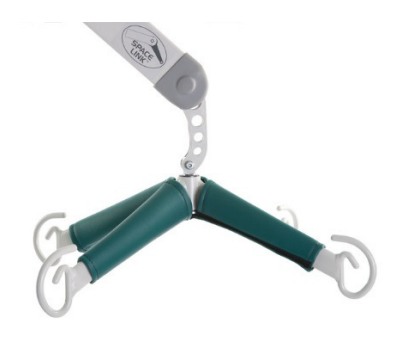
4 Point Yoke