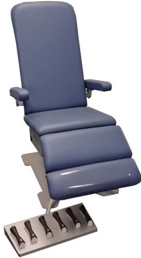
Shown with optional debris tray