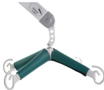
4 Point Yoke