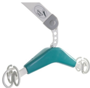
Tri Hook Yoke